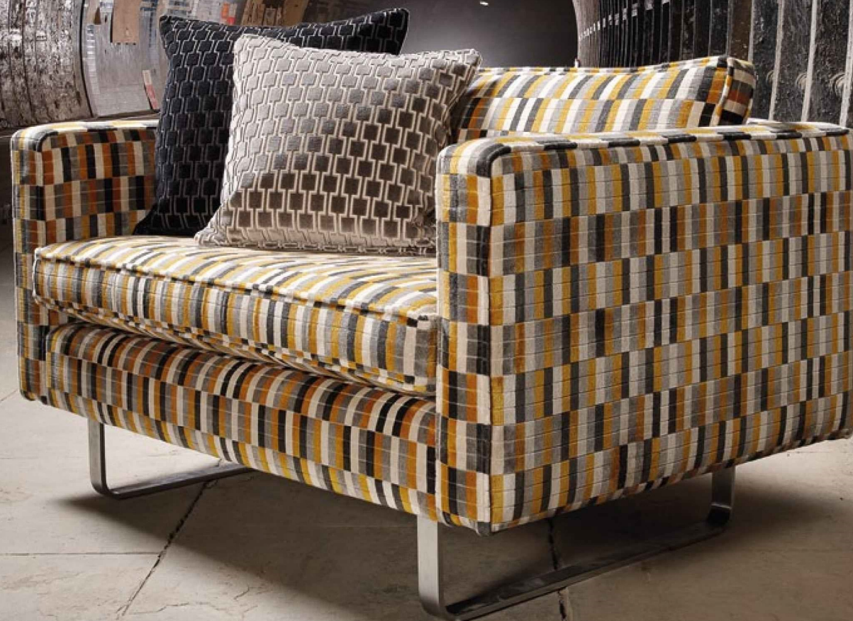
armchair: k5097/01 district gold. cushion left: k5096/11 bakerloo jet black. cushion right: k5096/10 bakerloo magnet.